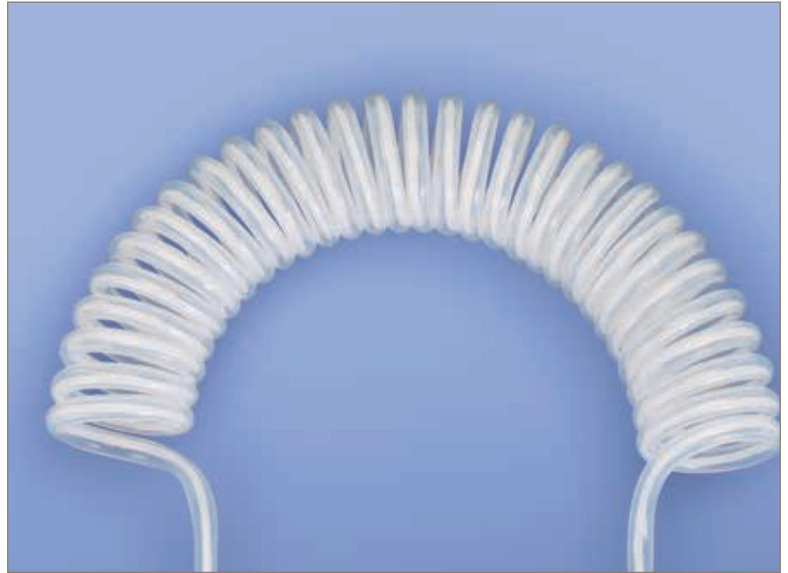
FEP or PFA Retractable Coil Tubing is also available in dual containment style